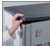
ABS plastic top cover